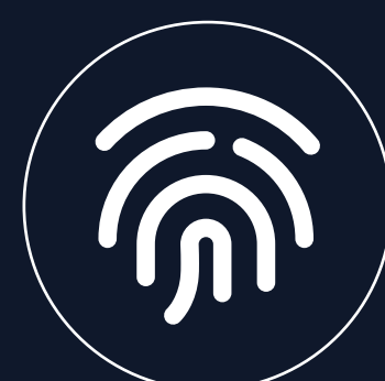
Press-type fingerprint recognition