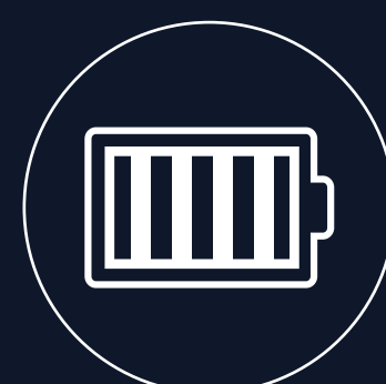
Two batteries, Long standby